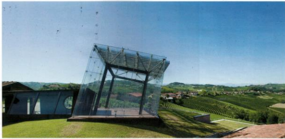
The Cube at Ceretto's Bricco Roccie winery is meant to showcase Barolo's landscape. The producer released an outstanding and widely available version from the 2012 vintage.

the Barolos I reviewed cost less than $60, including the Giacomo Ascheri Barolo 2012 (94, $40), Schiavetta Barolo Cerretta 2012 (94, $53) and M. Marengo Barolo Bricco delle Viole 2012 (94, $53). All are made in small quantities, however. Three that are more widely available are the Ceretto Barolo 2012 (93, $55), G.D. Vajra Barolo Albe 2012 (92, $42) and Vietti Barolo Castiglione 2012 (91, $52).